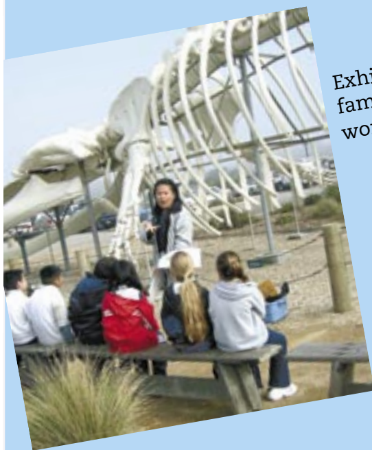
Exhibit hall, aquarium, touch tank, family programs, tours, world's largest whale skeleton!